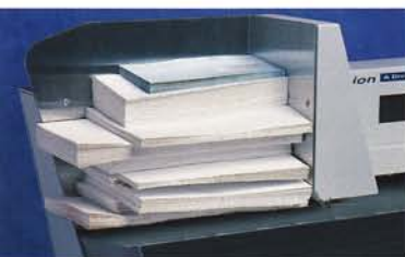
Feed area accepts various size envelopes.