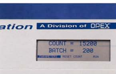
Job running/batching status.