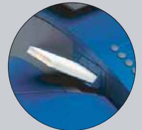
2. Label Dispenser