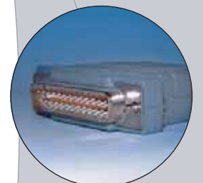
5. Supplementary Interface